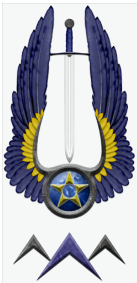
Figure 0.1 Mission, Vision and Commander's Interest Items